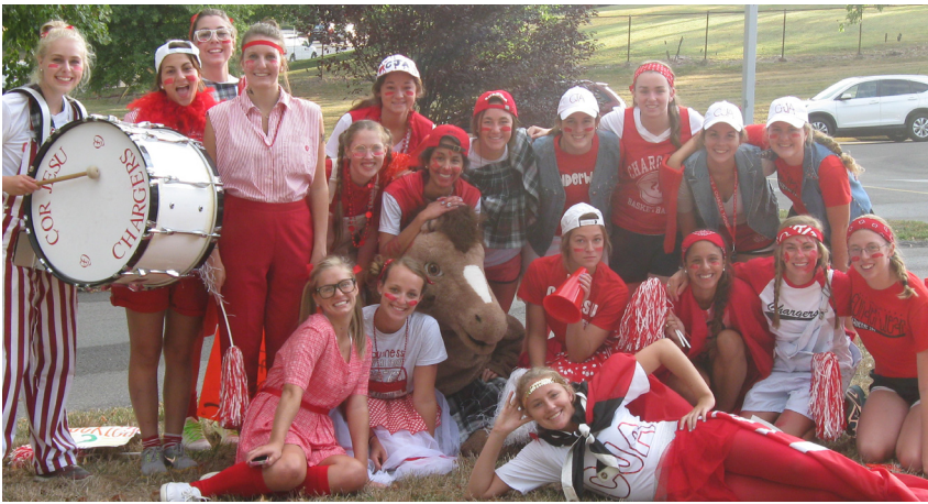
Senior StuCo members show their spirit and CJ pride as they cheer for the last time on their final first day of school at Cor Jesu.