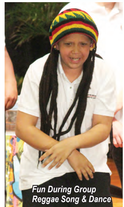
Fun During Group Reggae Song & Dance