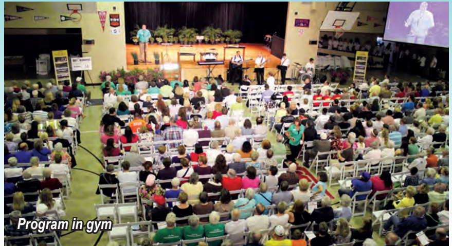
Program in gym