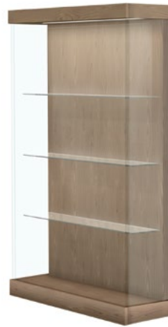
VANT48 - 48" wide floor case (pictured with Uptown Walnut finish)

72 3/4"H x 23 1/2"W x 14 7/8"D Shipping weight: 219 LBS