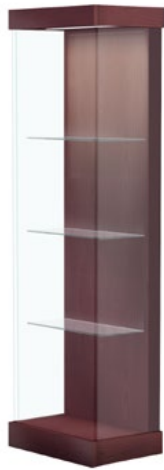
VANT24 - 24" wide floor case (pictured with a Cherry finish)

wood laminate, medium floor case with 3 full-length fixed glass shelves