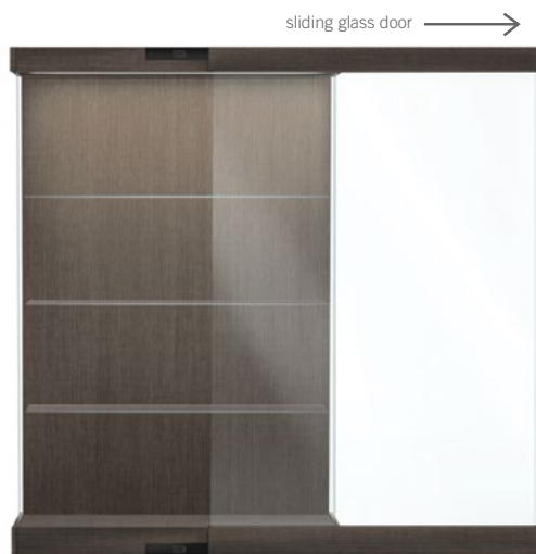
Pictured with Elm finish with right sliding door

*When ordering a Vantage display case, you must choose between a right or left sliding glass door.