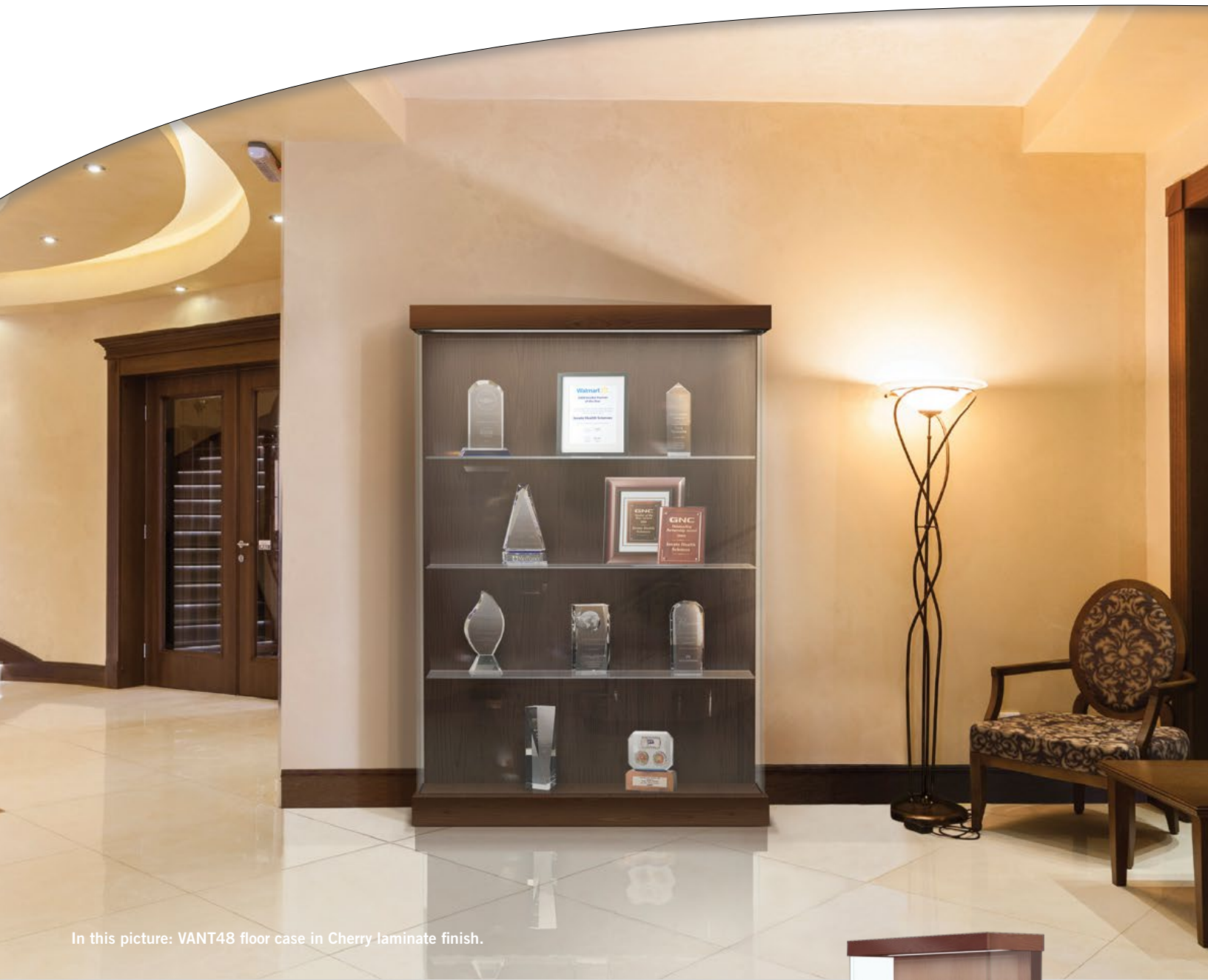
In this picture: VANT48 floor case in Cherry laminate finish.