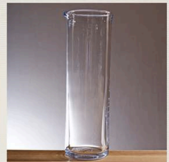
Ascutney Cocktail Pitcher