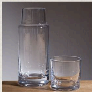
Ascutney Carafe & Glass Set