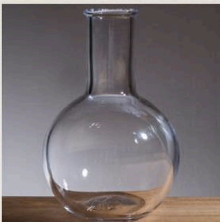
Ascutney Lab Decanter