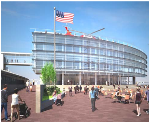
The National Coast Guard Museum will be an interactive, educational facility.

In 2013, the 24 th Commandant of the U.S. Coast Guard, Admiral Robert J. Papp, Jr., USCG (Ret.) announced the location on the waterfront in New London. Payette of Cambridge, Massachusetts, the