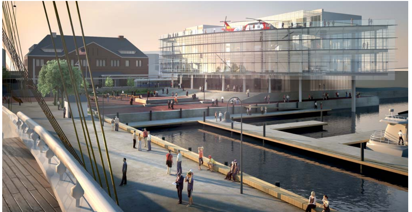
Visitors to the National Coast Guard Museum will be greeted by several Coast Guard assets.

architects of record for the museum, have completed concept drawings of the project that utilizes the space adjacent to the city's train station and ferry terminals.