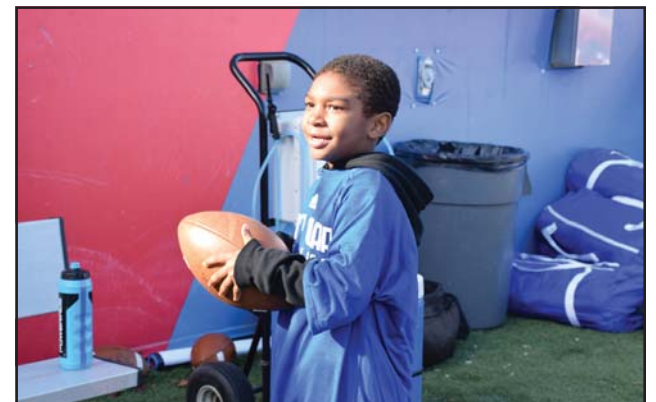
Scenes from Last Year's Celebrate New London.