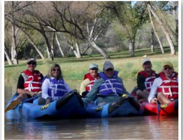
The Salt and Verde Alliance is protecting water supplies that are critical to Arizona.

Submitted by: Pima County Regional Wastewater Reclamation Department