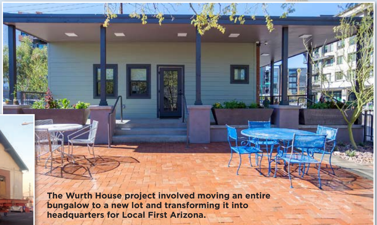
The Wurth House project involved moving an entire bungalow to a new lot and transforming it into headquarters for Local First Arizona.