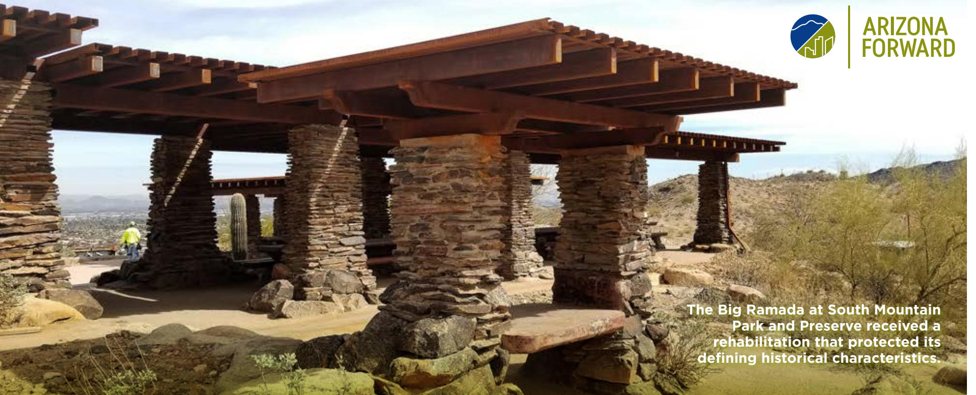
The Big Ramada at South Mountain Park and Preserve received a rehabilitation that protected its defining historical characteristics.