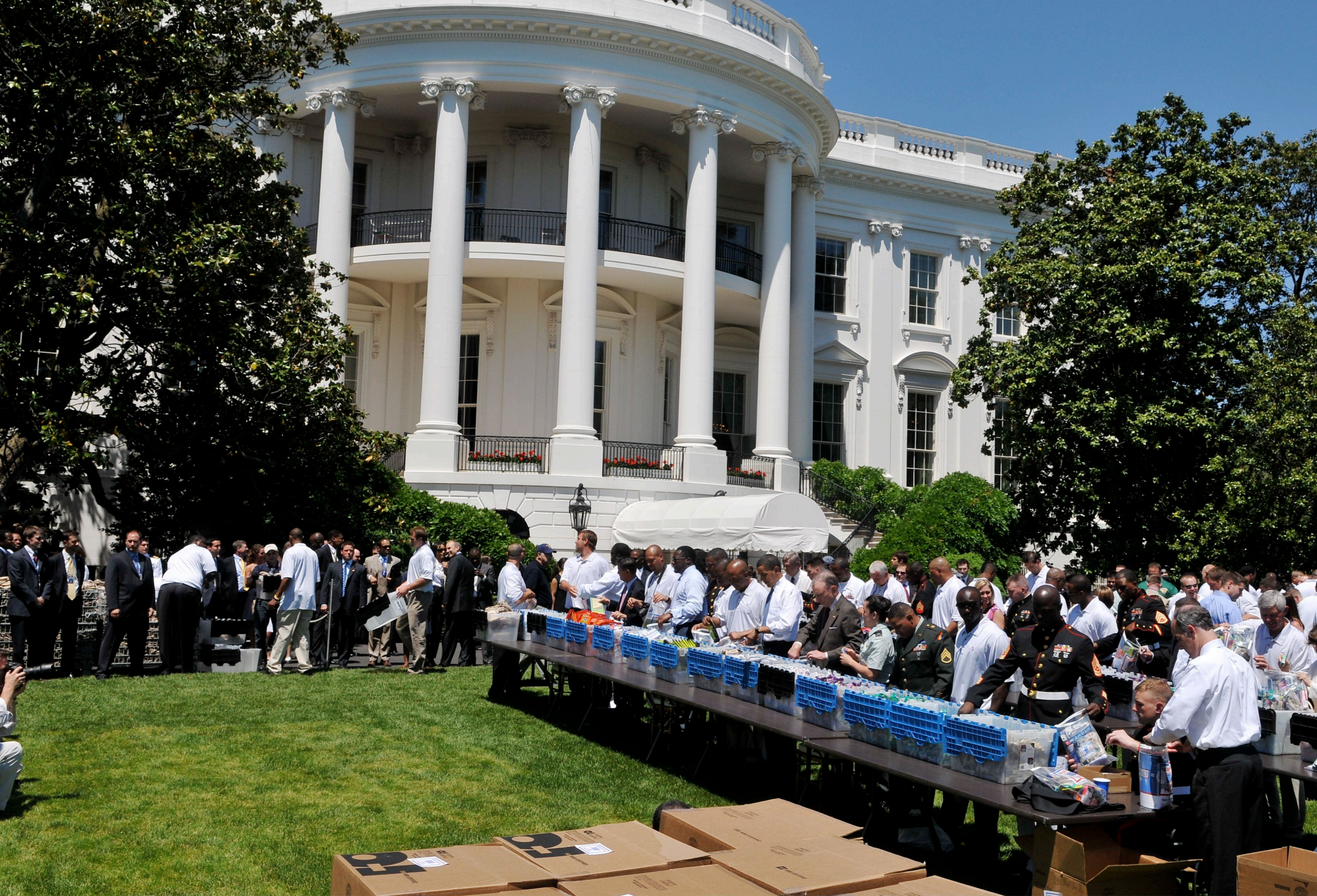
President Obama shows his support for U.S. troops by hosting an Operation USO Care Package stuffing party at the White House in 2009. Joining him in this effort were the Super Bowl Champion Pittsburgh Steelers and numerous wounded warriors.