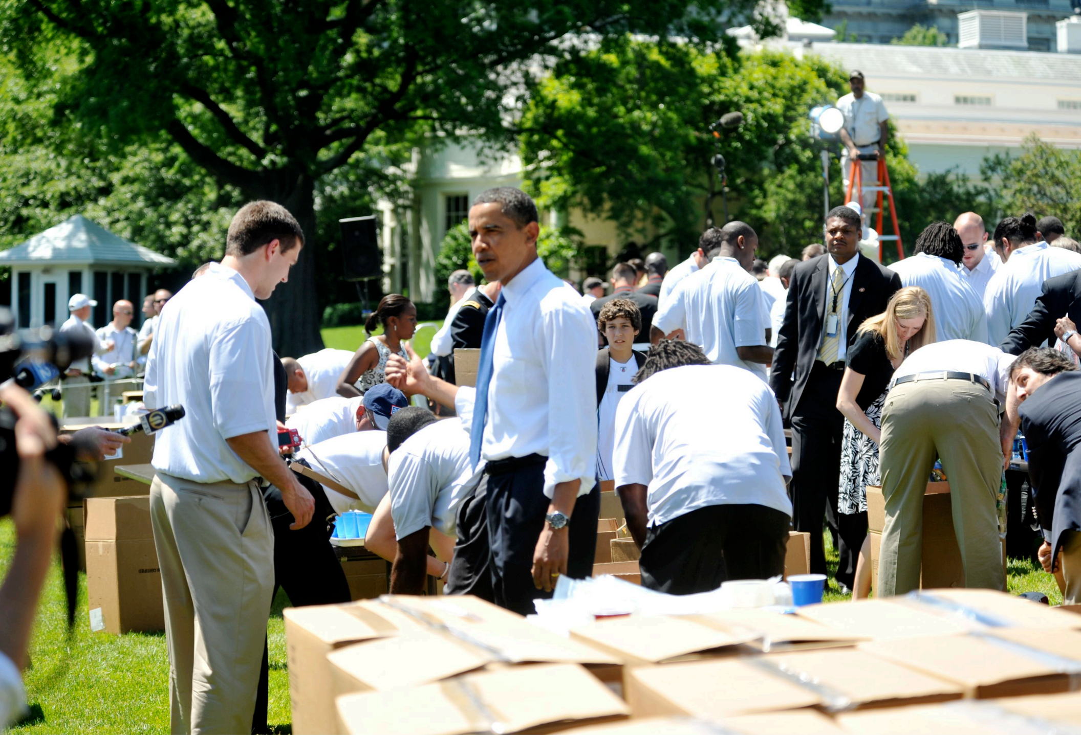
USO volunteers set up the supplies needed for the stuffing party.