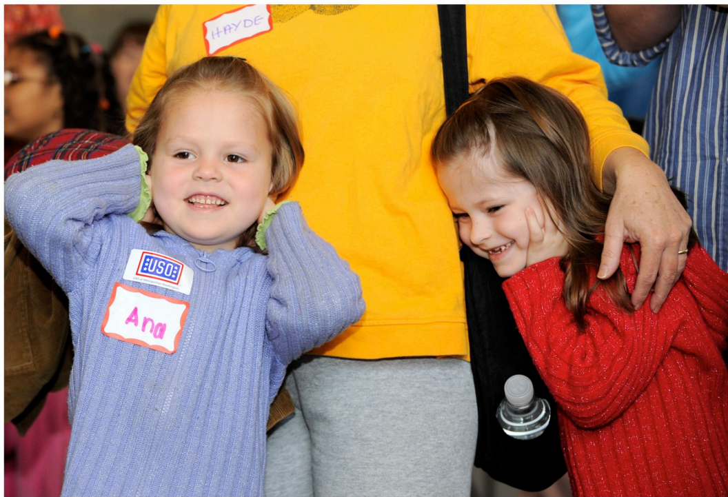
Kids enjoyed arts and crafts activities prior to stuffing care packages.