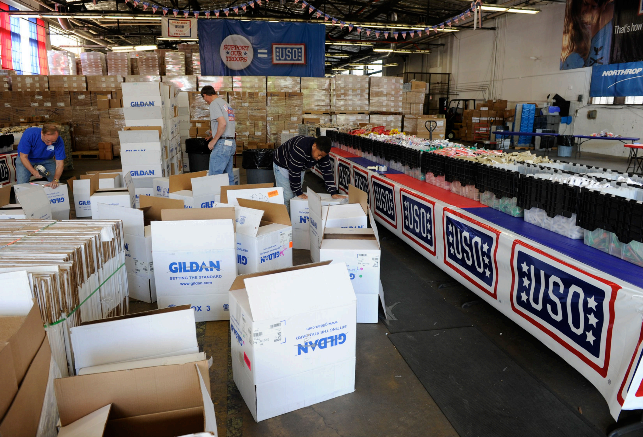
USO of Metropolitan Washington employees are primarily responsible for overseeing the care package program, which is based out of Fort Belvoir.