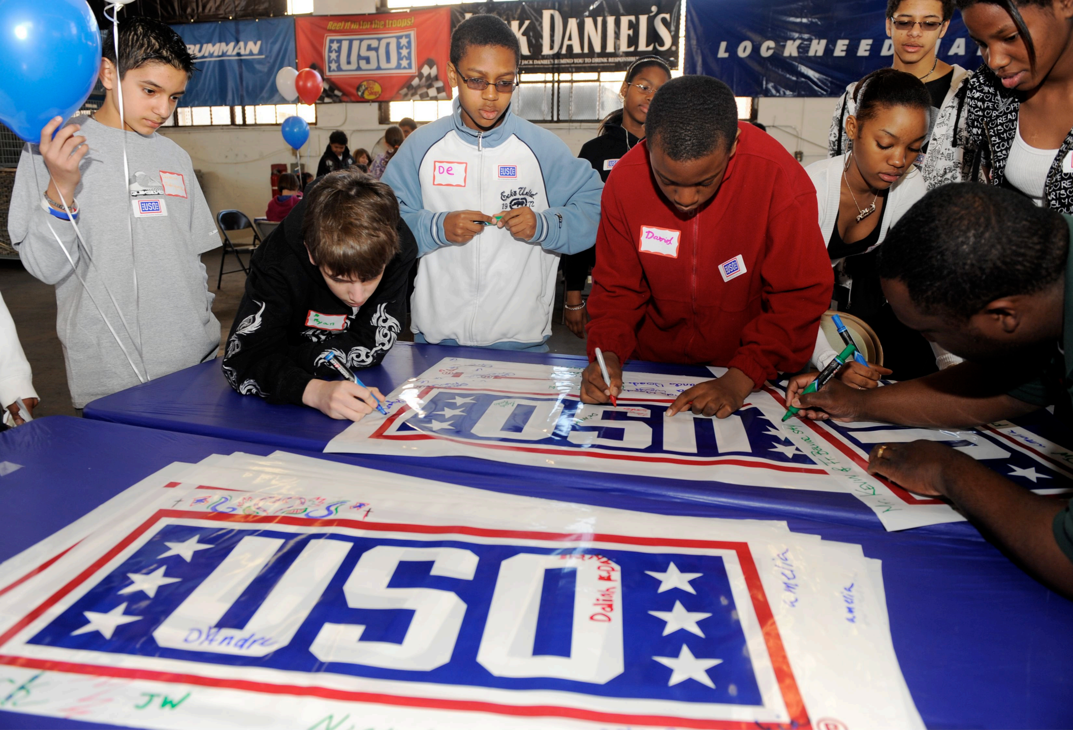
This event gives the military children the opportunity to show their support for their parents, many of whom are deployed.