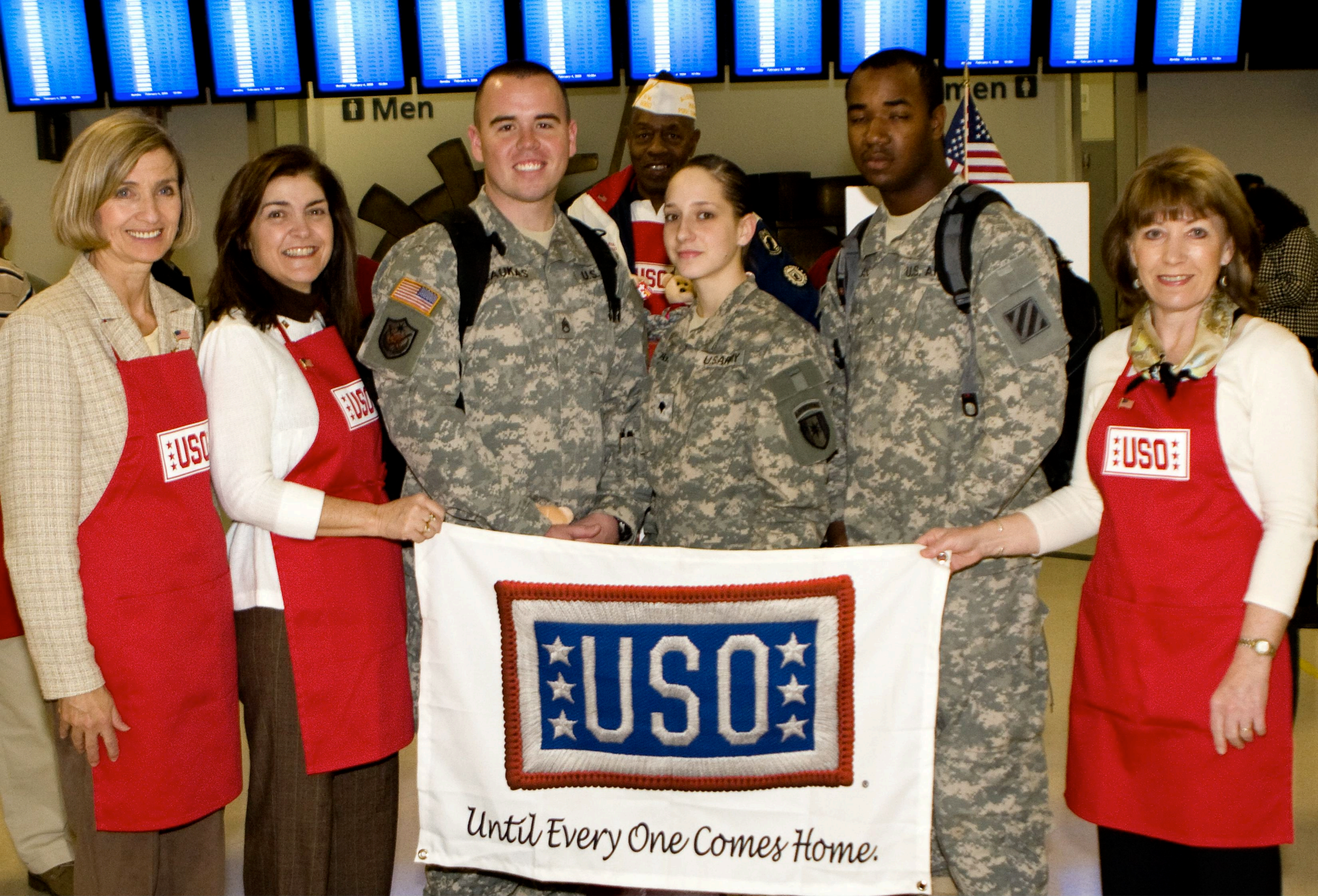
USO Georgia volunteers celebrate the USO's Birthday by providing deploying troops with USO care packages.