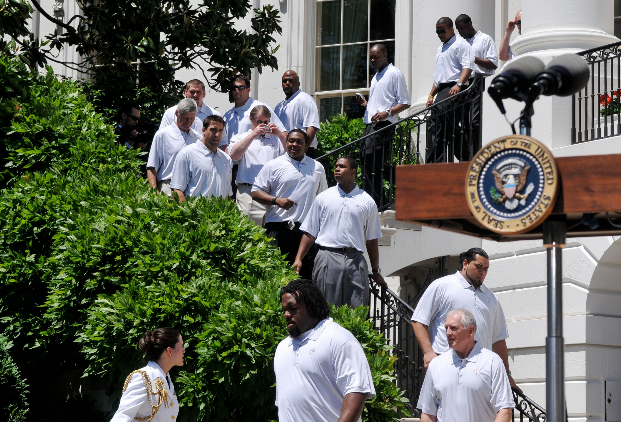
The Pittsburgh Steelers volunteered their time to participate in the stuffing party and help prepare care packages.