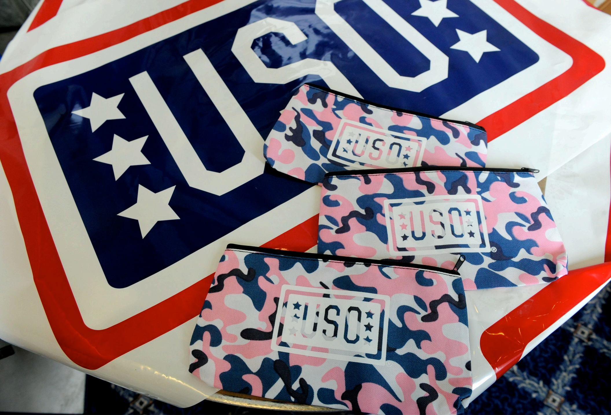
In November 2009, the USO prepared the Operation USO Care Package for Women on Capitol Hill. Second Lady, Dr. Jill Biden & Speaker of the House Congresswoman Nancy Pelosi (D-CA) attended the special kick-off event.