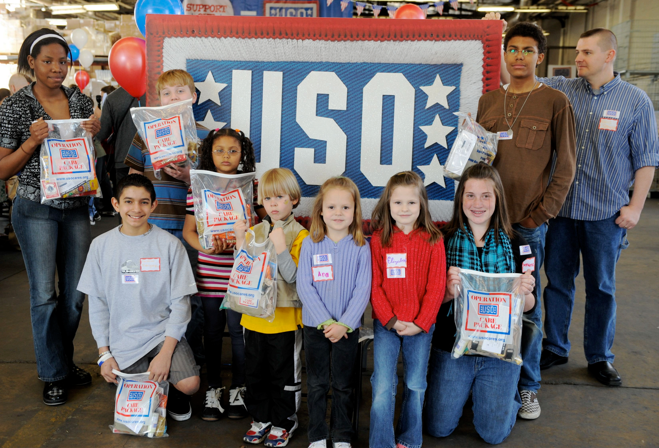
Each year, the USO holds a Military Kids Operation USO Care Package stuffing party during the Month of the Military Child in April.