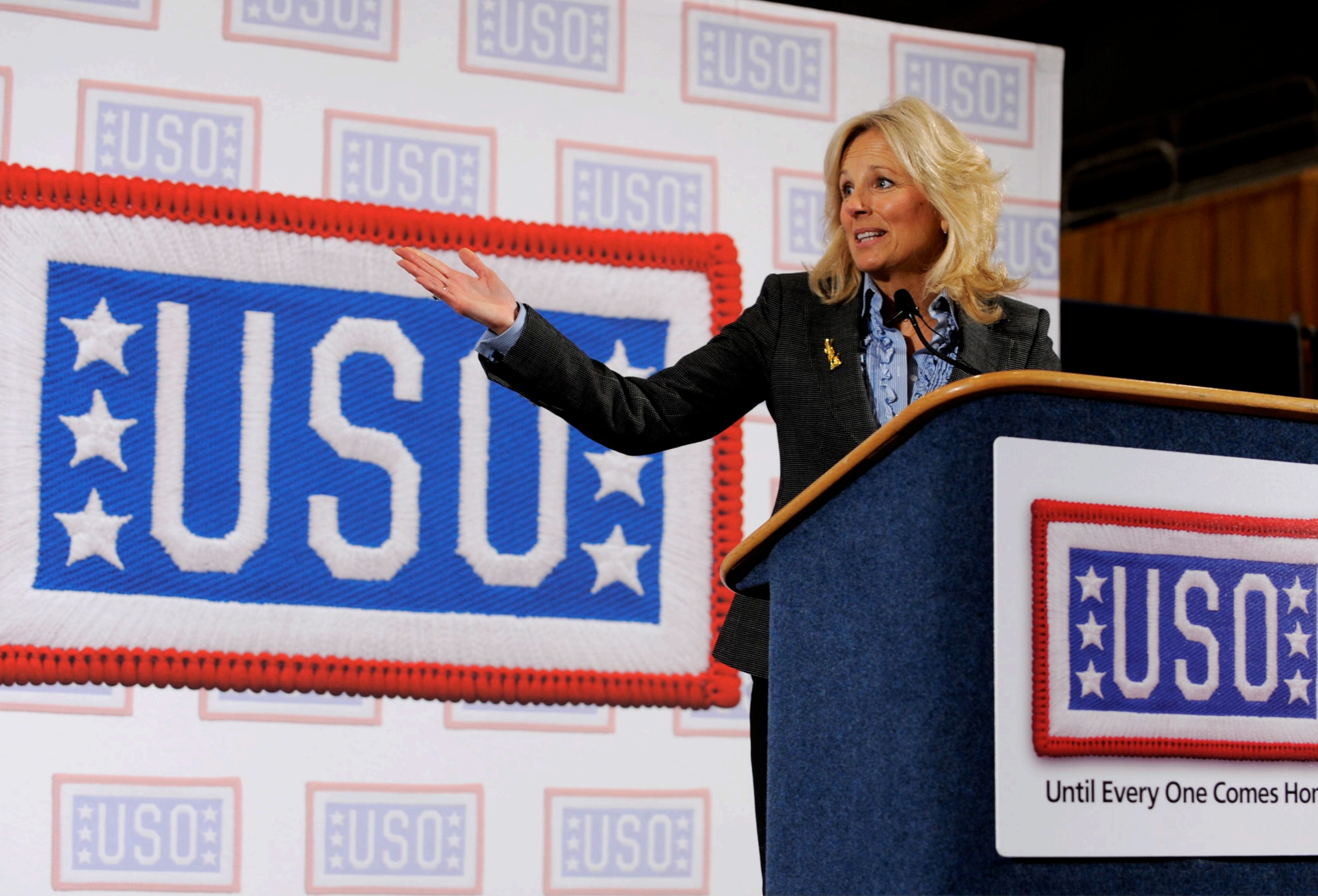
In March 2010, Dr. Jill Biden helped kick off the Military Family Care Package stuffing party. This event was made possible with the support of the Department of Defense, FedEx, Hallmark Cards, Verizon Communications, Rocketlife, Kodak, Tutor.com, Smoothie King and Publix Super Markets.