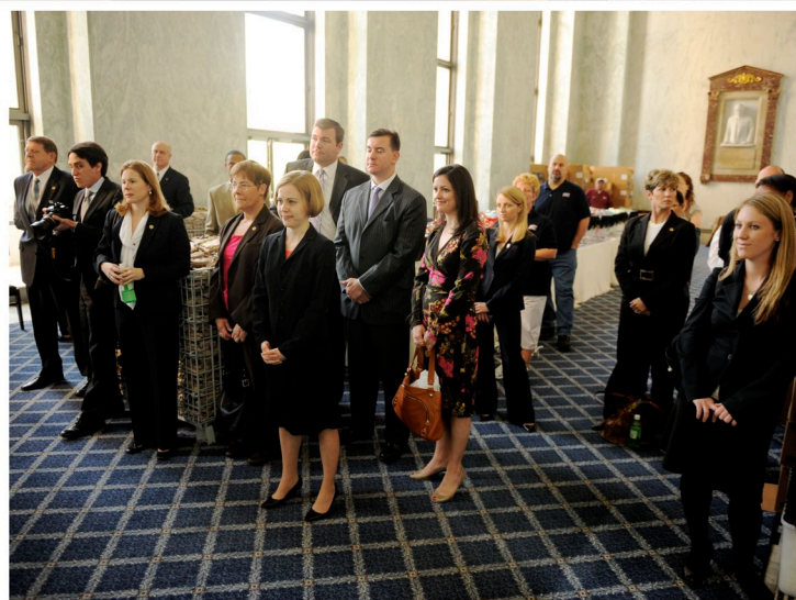
Congressmen Silvestre Reyes (D-TX) and Jeff Miller (R-FL), along with other members of the USO Congressional Caucus helped kick off the event.