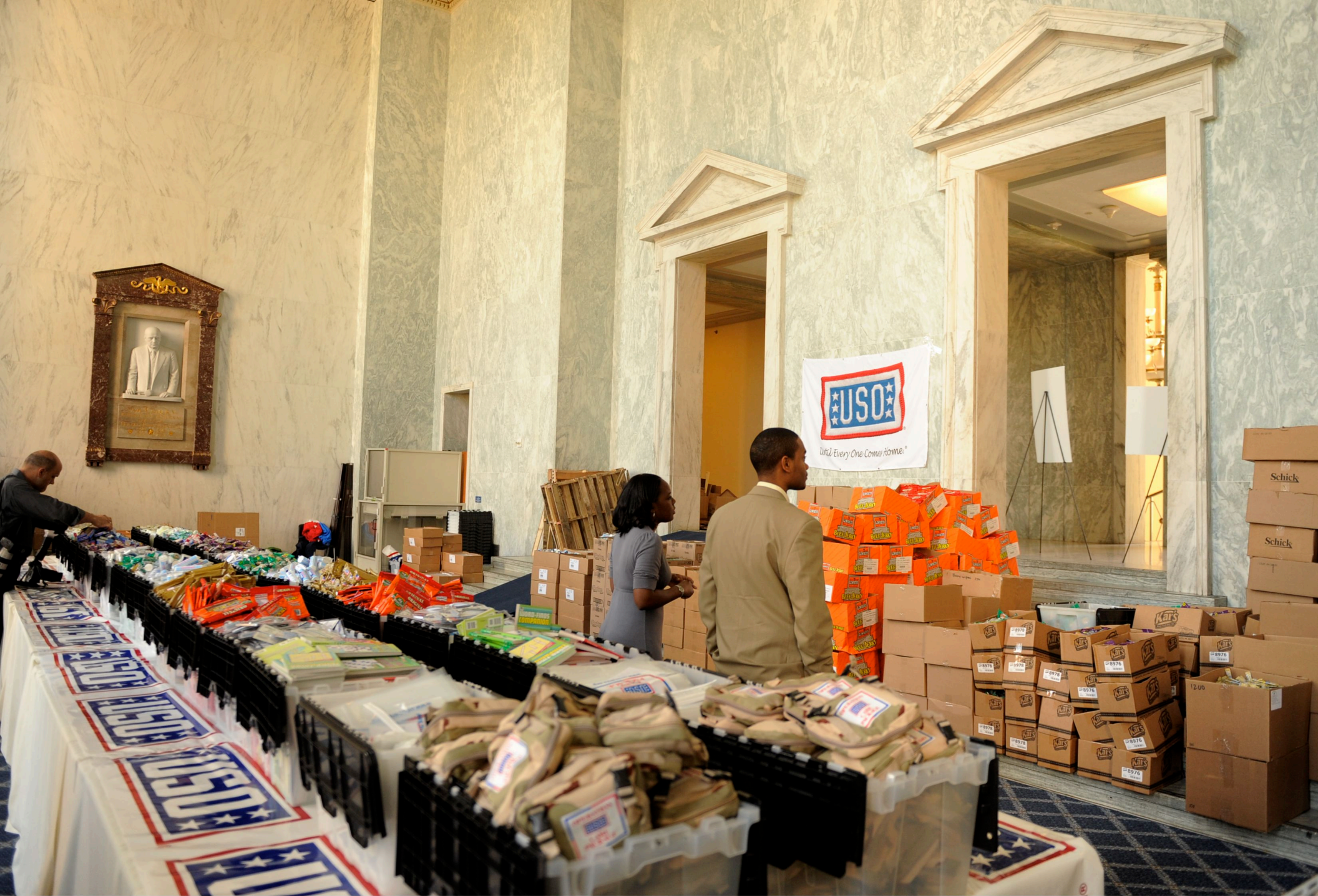
Every year, the USO works with members of its Congressional Caucus to hold an Operation USO Care Package stuffing party on Capitol Hill.