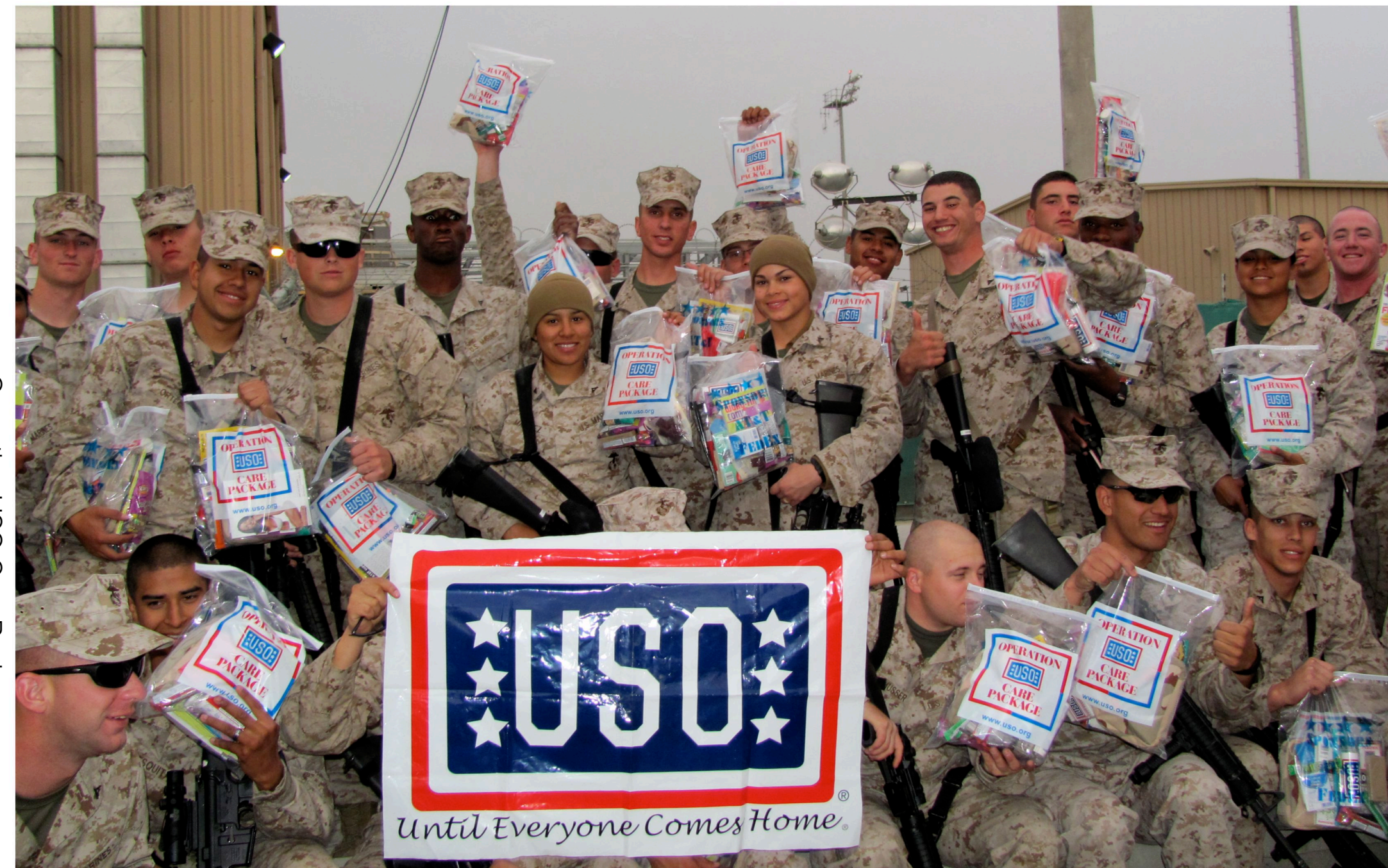
Operation USO Care Package