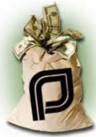
PPSE 2009 Form 990