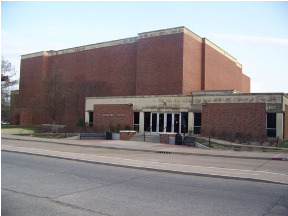
Current OSU Performing Arts Center, the Seretean Center