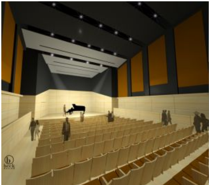
Beck Design provides a simulated projection of a performing hall inside the new center.