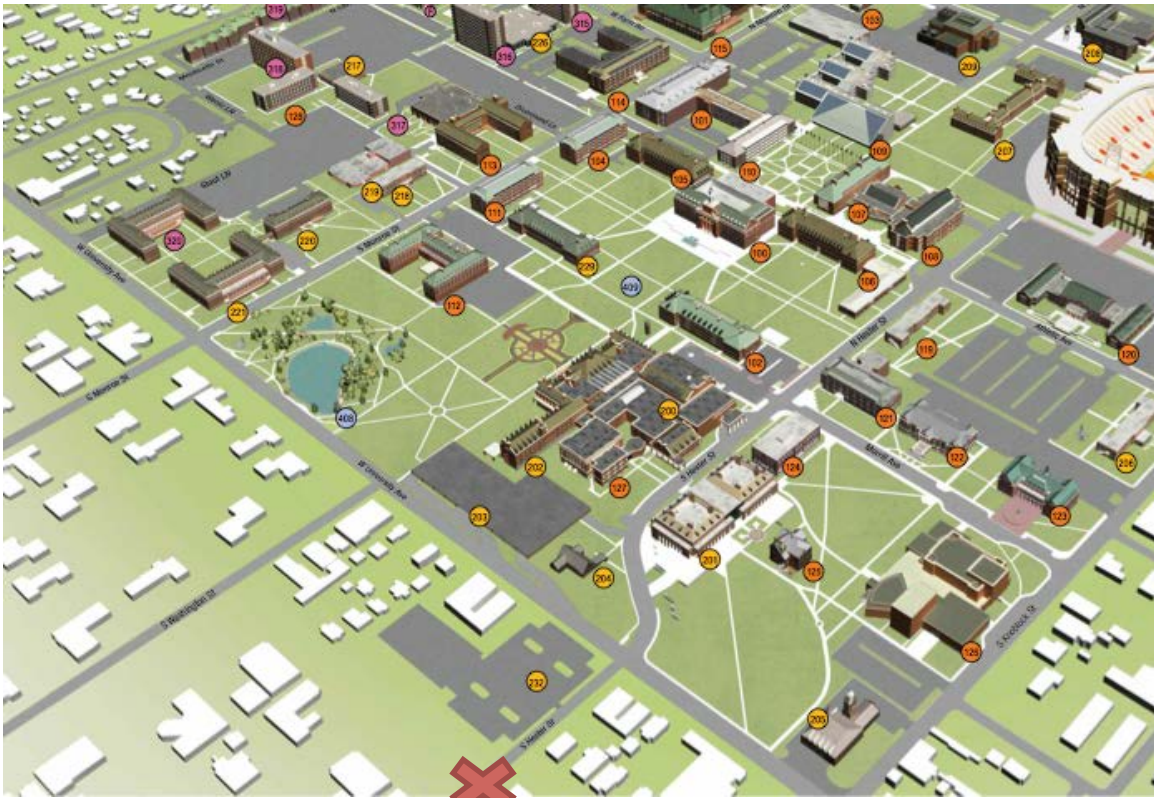
3D map of the OSU Campus, and projected construction site.