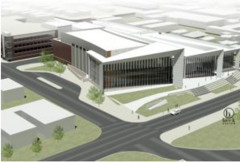
Beck Design provides a simulated projection of a performing hall inside the new center.