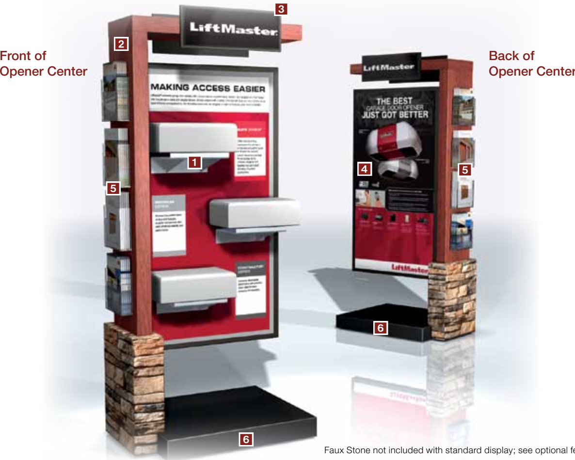
Faux Stone not included with standard display; see optional features.