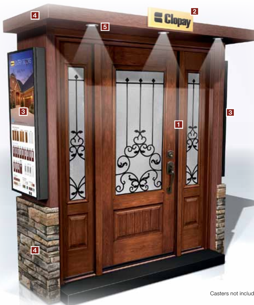
Front of Entry Door Display

Casters not included due to weight of display.