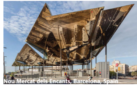
Nou Mercat dels Encants, Barcelona, Spain