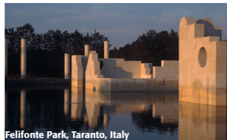
Felifonte Park, Taranto, Italy