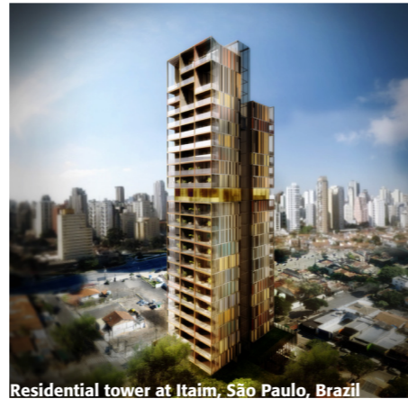
Residential tower at Itaim, São Paulo, Brazil

Wining entry of a national competition with the project PARCMOBIL.