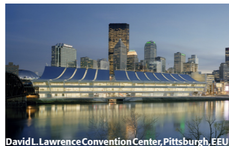
David L. Lawrence Convention Center, Pittsburgh, EEUU