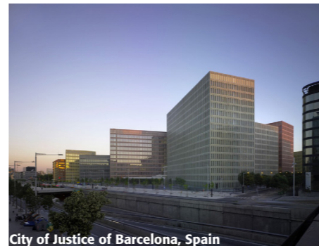
City of Justice of Barcelona, Spain